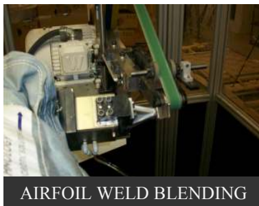
AIRFOIL WELD BLENDING