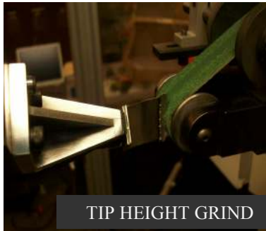
TIP HEIGHT GRIND